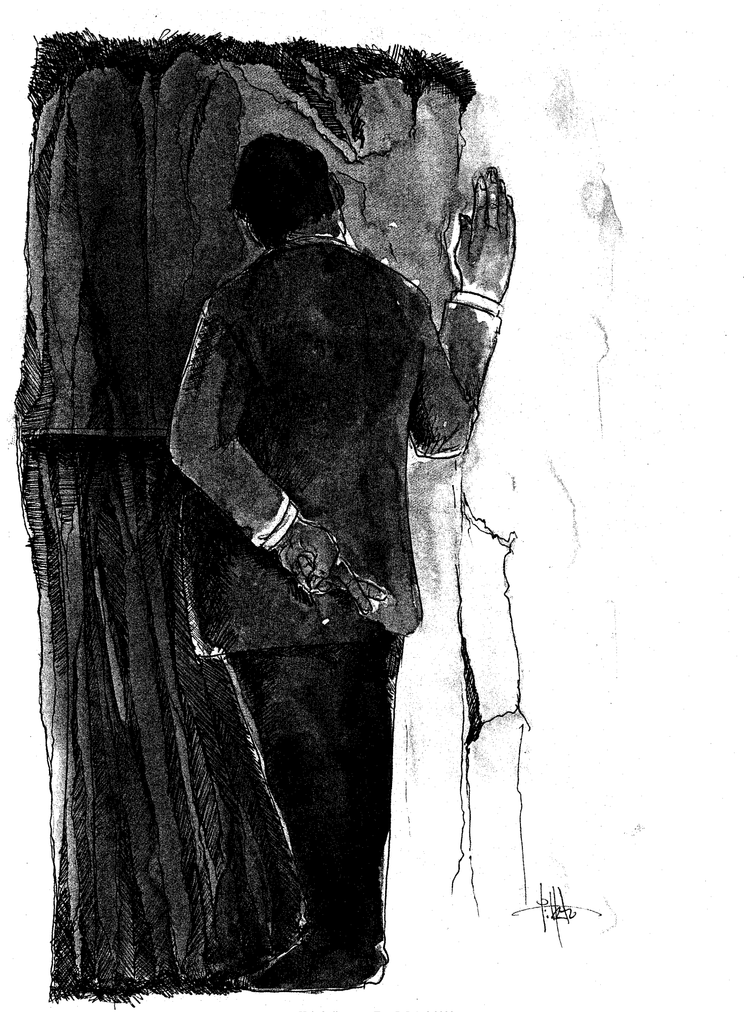
HeinOnline -- 66 Tex. B.J. 963 2003