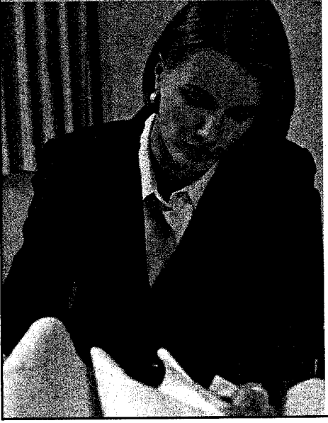
HeinOnline -- 66 Tex. B.J. 965 2003