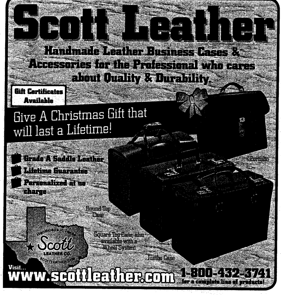
HeinOnline -- 66 Tex. B.J. 966 2003

Courts that disagree with the sham affidavit doctrine usually argue that a court is precluded under the summary judgment rules from making a determination of the credibility of the witnesses. Specifically, both the federal and Texas rules preclude a court from weighing a witness' credibility at the summary judgment stage. 45 "The trial court's duty is to determine if there are any fact issues