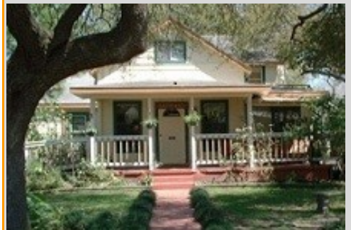
Above Pathway to Recovery's residential treatment facility for men in La Marque, Texas.

Since a picture is worth a thousand words, this year our STAR team is dedicated to visiting the treatment providers and community service centers where STAR clients attend rigorous