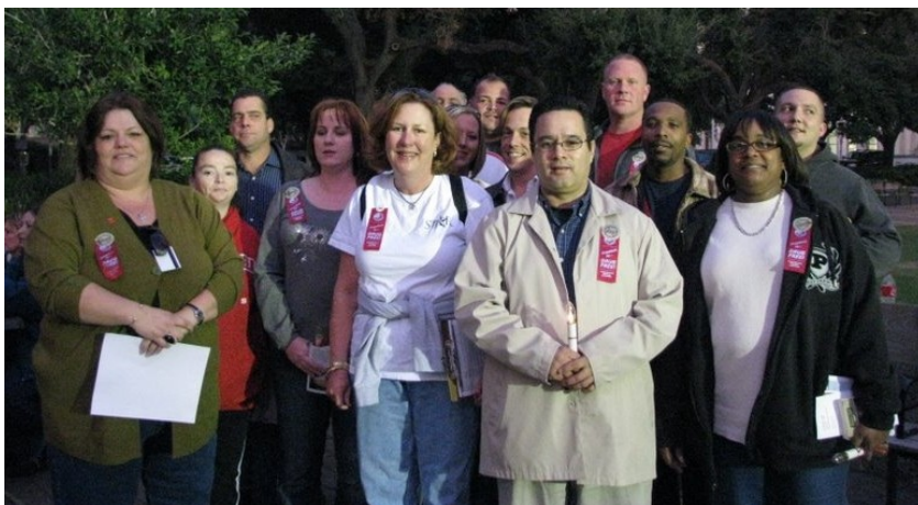
Right STAR clients, graduates, and staff at the City Hall Reflection Pool before the Vigil.

STAR thanks all the agencies involved for continuing to support recovery efforts like STAR in the Houston community.