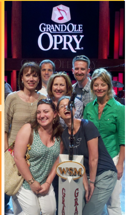
Above STAR staff members in Nashville's Grand Ole Opry.

The STAR Alumni would like to say thank you again to the Harris County Drug Court Foundation for making this year's Spring Picnic such a success. The money donated went directly to food and supply costs that allowed the STAR Program to have a wonderful event. Thank you for making this a highlight of the year!